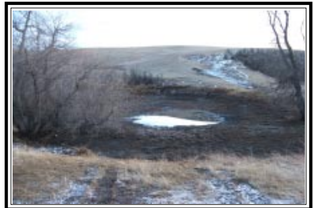
Effects of saltwater spill near Charbonneau Creek

DRC also asked that any water wells permitted include a backup system, such as an air gap, to keep contaminated materials out of fresh water aquifers.