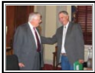
Senator Enzi (left) & Skip Waters

BBQ Tickets are $12 each or two for $20 and are available at every DRC office. Ticket price includes meal, dance and raffle. Top prize is 100 lbs. of beef born, raised and slaughtered in the United States. You don't have to be present to win.